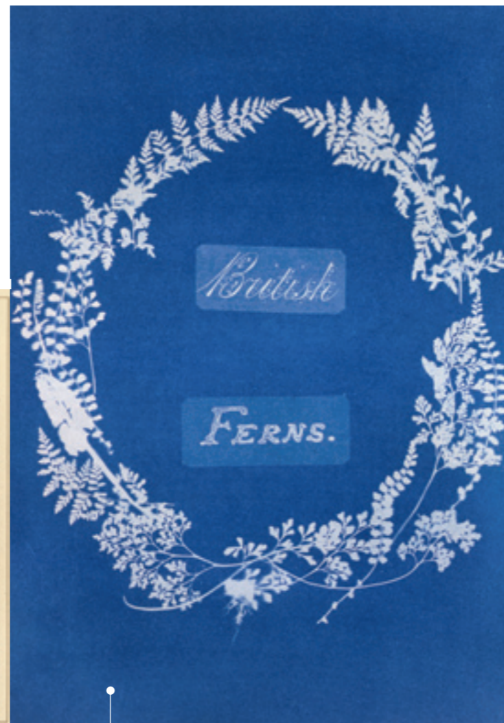
Anna Atkins (1799-1871) produced a series of detailed plant portraits in her Cyanotypes of British and Foreign Flowering Plants and Ferns , 1854.