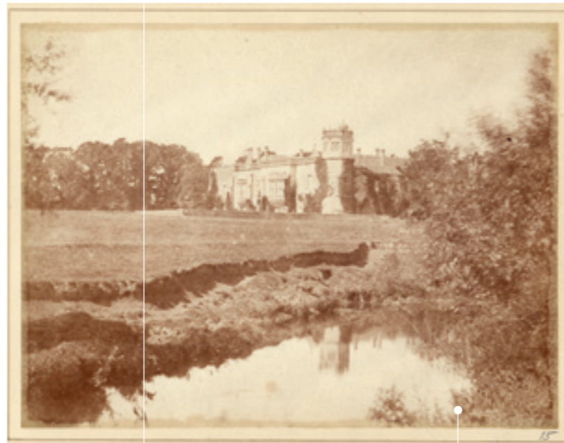
Talbot's photograph of his family home, Lacock Abbey, was taken in 1844 and appeared in his book The Pencil Of Nature .