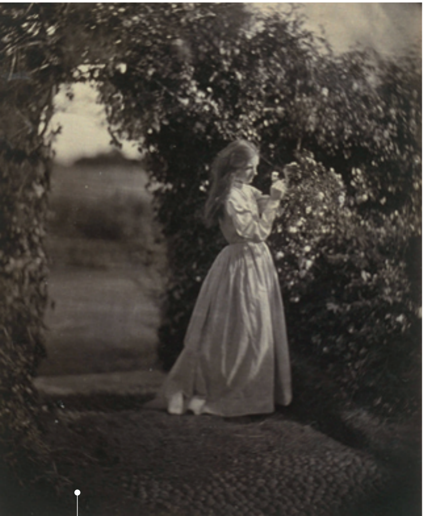
Julia Margaret Cameron often photographed her subjects with flowers, each of which was imbued with symbolism. Roses carried multiple meanings, but in general signified oblivion or imagination.