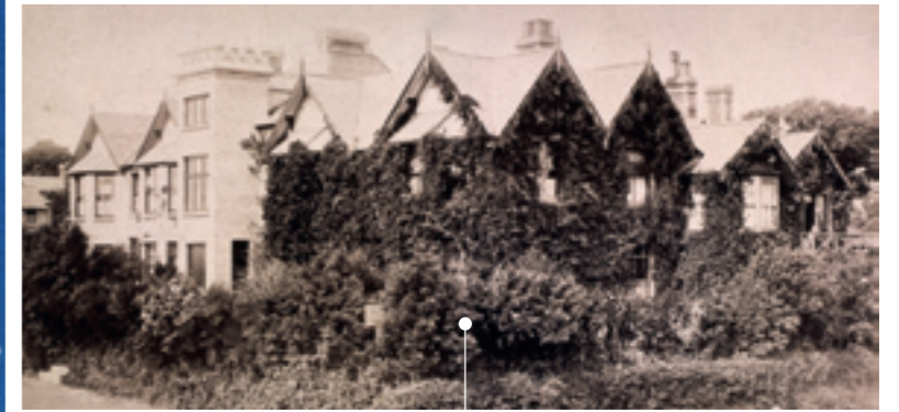
Dimbola Lodge, the Isle of Wight home of Julia Margaret Cameron, pictured in 1871. The house is now a museum.