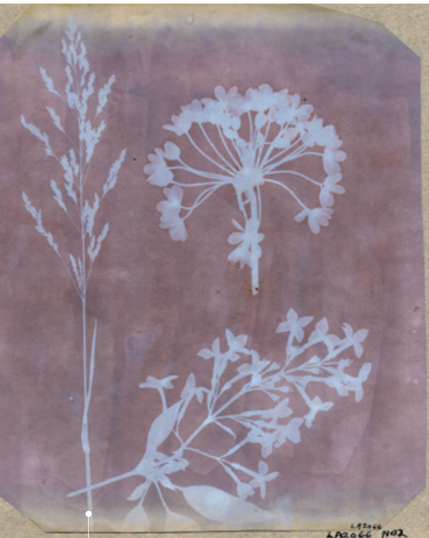
A photogenic drawing by William Henry Fox Talbot using botanical specimens from his garden. Taken around 1839, the year he announced his discoveries in photography.