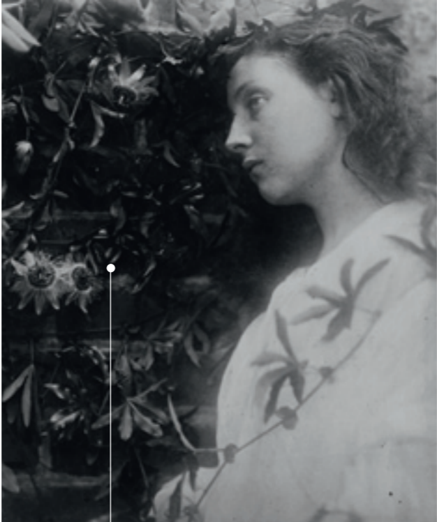
Maud , 1875. Cameron's portraits for Idylls of the King by the Poet Laureate Alfred Lord Tennyson were designed to look like contemporary oil paintings.