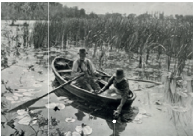
Gathering Water-Lilies , 1886, by Peter Emerson (1856-1936), who excelled at naturalistic shots of the Norfolk countryside.